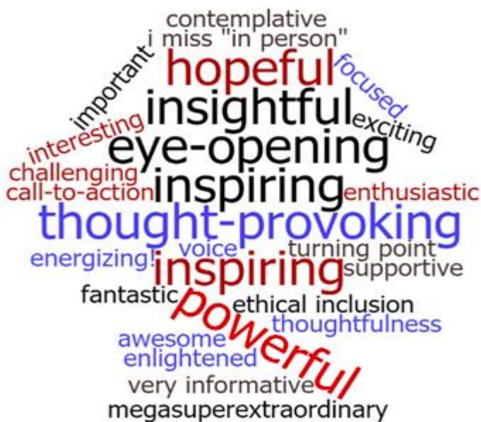
Day 3. Results of the word cloud using one word to describe the conference.

We also thank Troy Chartier at Swift Media for his stellar website support. Troy often accomplished the impossible in short time – thank you Troy!