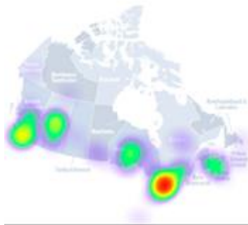
Day 1. Heat map of attendees by location

From the provinces to the territories, from the Atlantic to the Pacific (and beyond), the virtual platform of the conference facilitated 507 research ethics administrators, REB members, researchers, government agency representatives, community members and research participant partners to attend our virtual conference and allowed us to reach the highest number of attendees in CAREB-ACCER's conference history.